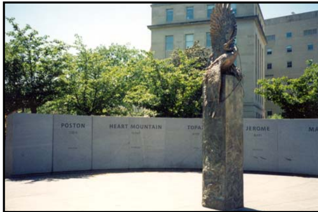
The memorial to Japanese-Americans interned during World War II, is found in Washington, D.C.