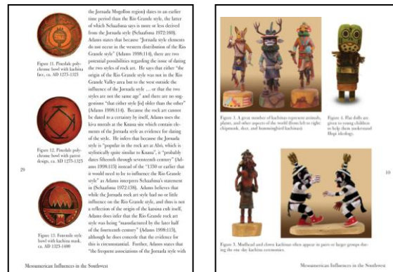
Figure 2 – Examples of a typical pages from the catalog