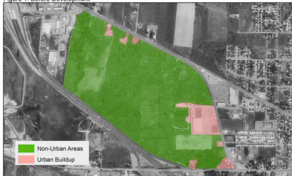
Figure 1: Before Development